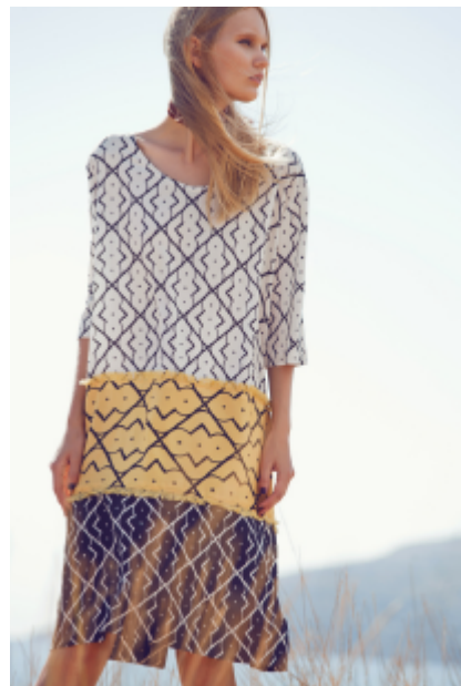
Spring Summer 2017