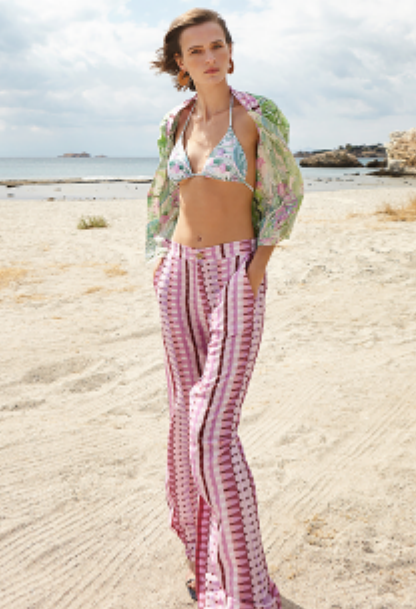
Spring Summer 2022