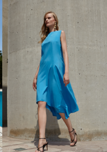
Spirng Summer 2020