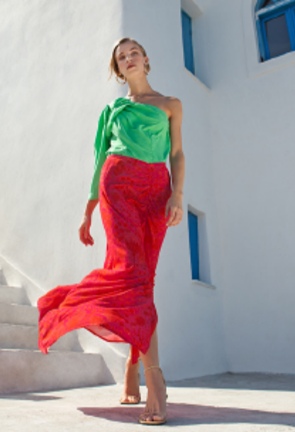
Spring Summer 2021