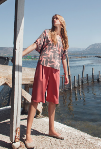
Spring Summer 2018