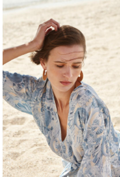
Spirng Summer 2022