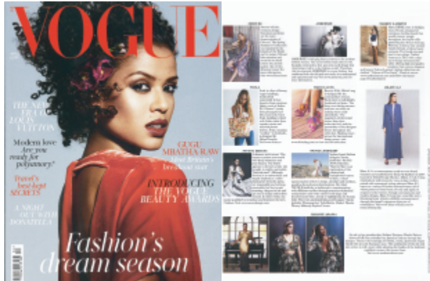
UK Vogue April 2018