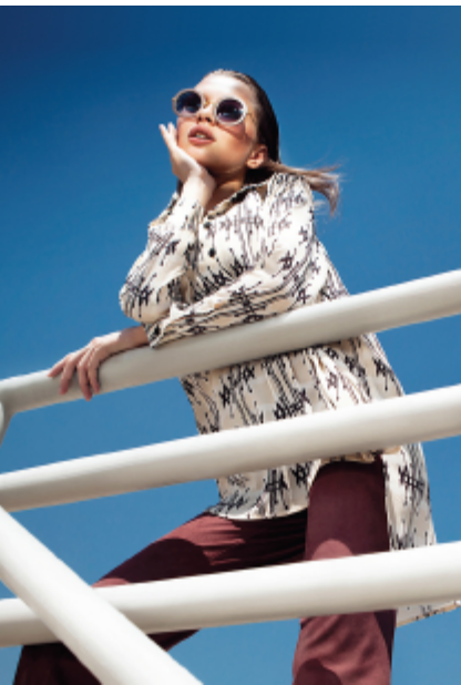
Autumn Winter 2015-2016