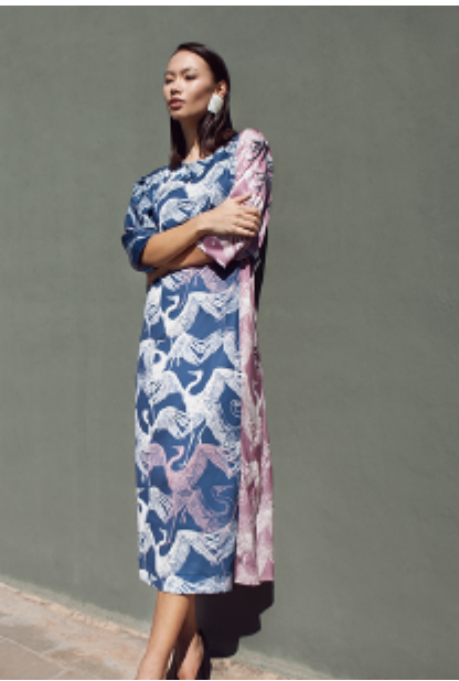
Autumn Winter 2019-2020