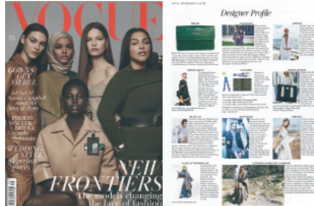
UK Vogue May 2018