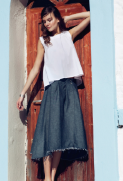
Spring Summer 2016