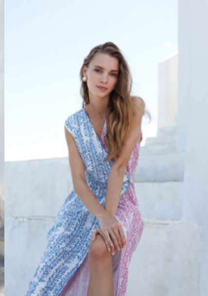
Spring Summer 2021