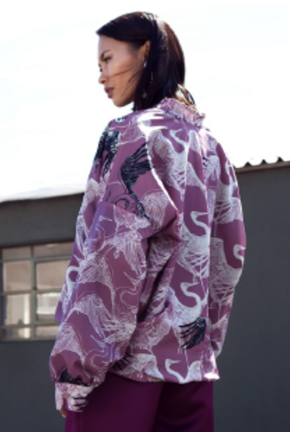
Autumn Winter 2019-2020