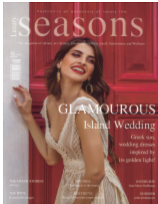
Luxury Seasons August 2018