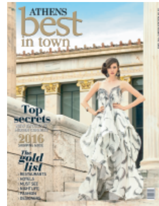
Athens Best in Town 2016