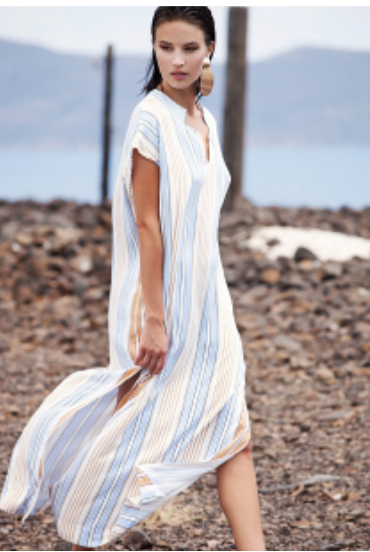
Spring Summer 2019