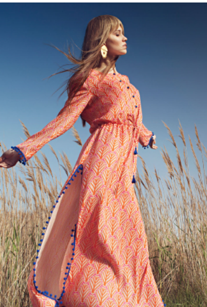
Spring Summer 2015