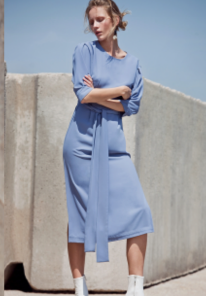
Autumn Winter 2018-2019